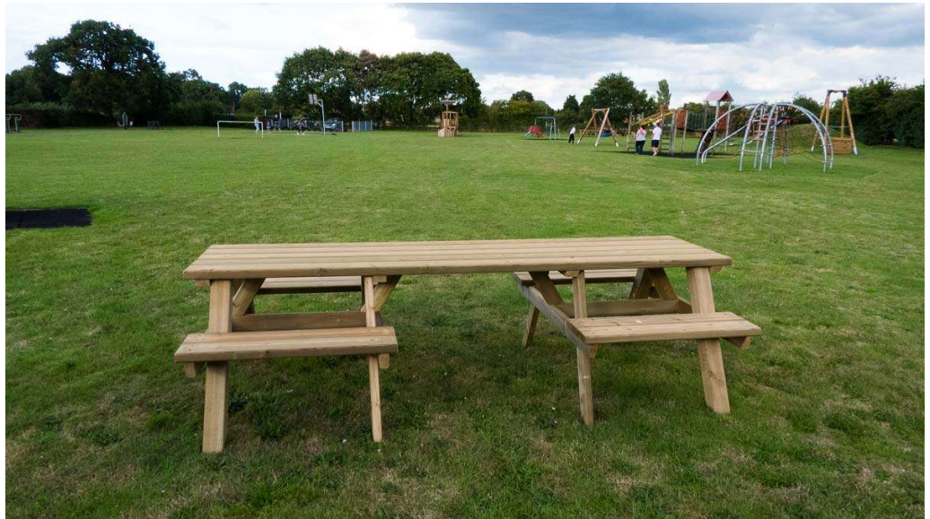
two large picnic benches.