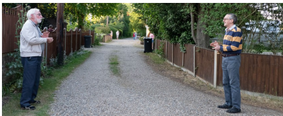
Newgate neighbours Clap the NHS

For 10 weeks neighbours have been emerging from their homes at 8pm to applaud those working so hard for us all in the care sectors - whilst maintaining 'social distancing' of course! This was to be the last event of this kind and there was a good turn out as people clapped, rang bells and banged pans to express our thanks to those who put themselves at risk for others.